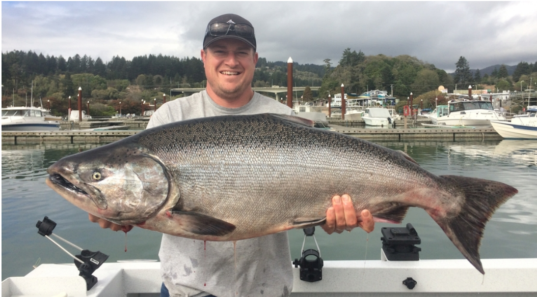
Salmon fishing on the Oregon Coast, a fall tradition.