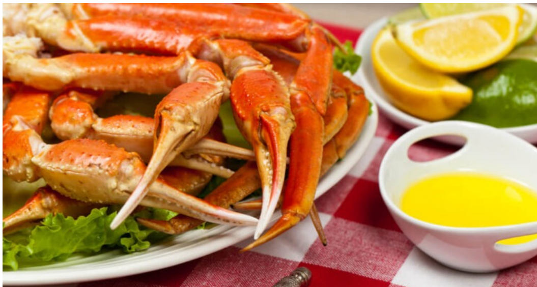
A delicious meal from Seaside, Oregon.