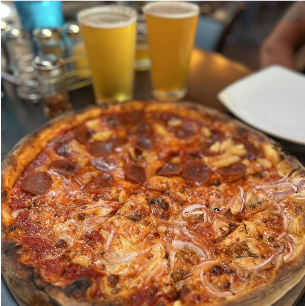
A delicious meal from Brookings, Oregon.