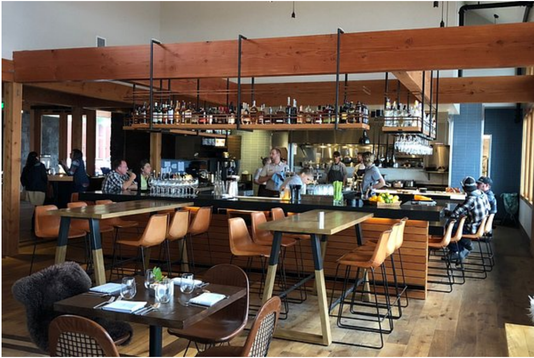
Delicious food from Pacific City, Oregon.