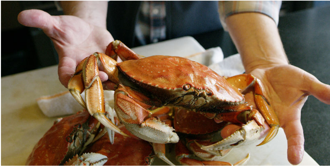
Fresh Dungeness Crab, a winter delight.