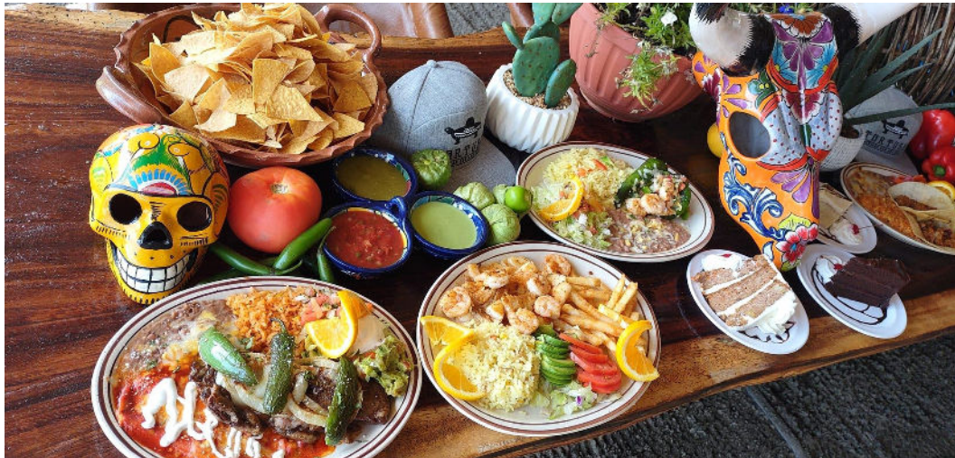
A taste of Gold Beach, Oregon.