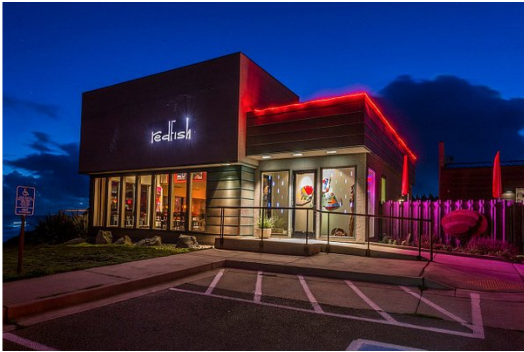
Fresh seafood from Port Orford, Oregon.