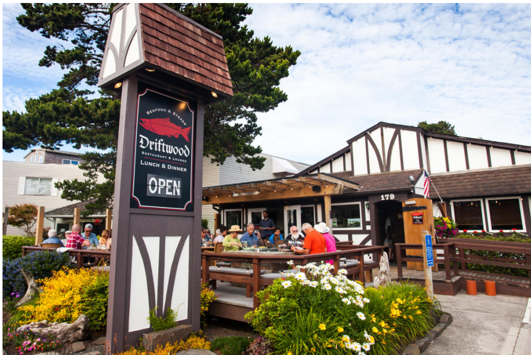
A taste of Cannon Beach's culinary offerings.