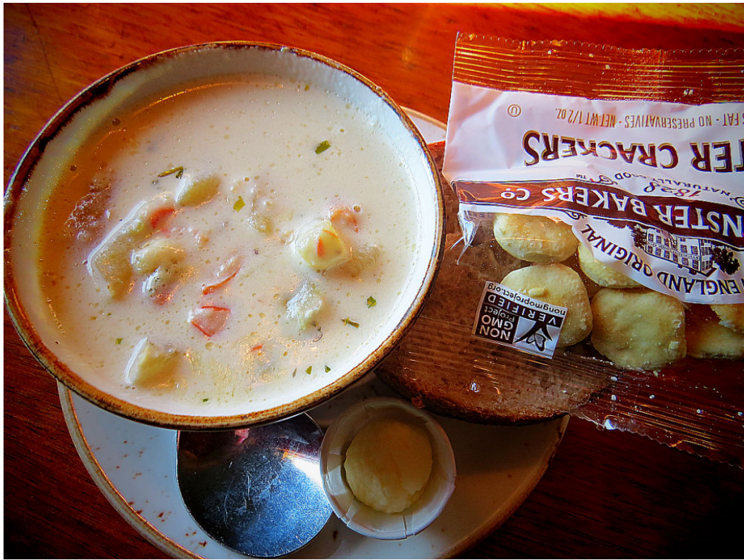
A taste of Yachats, Oregon.