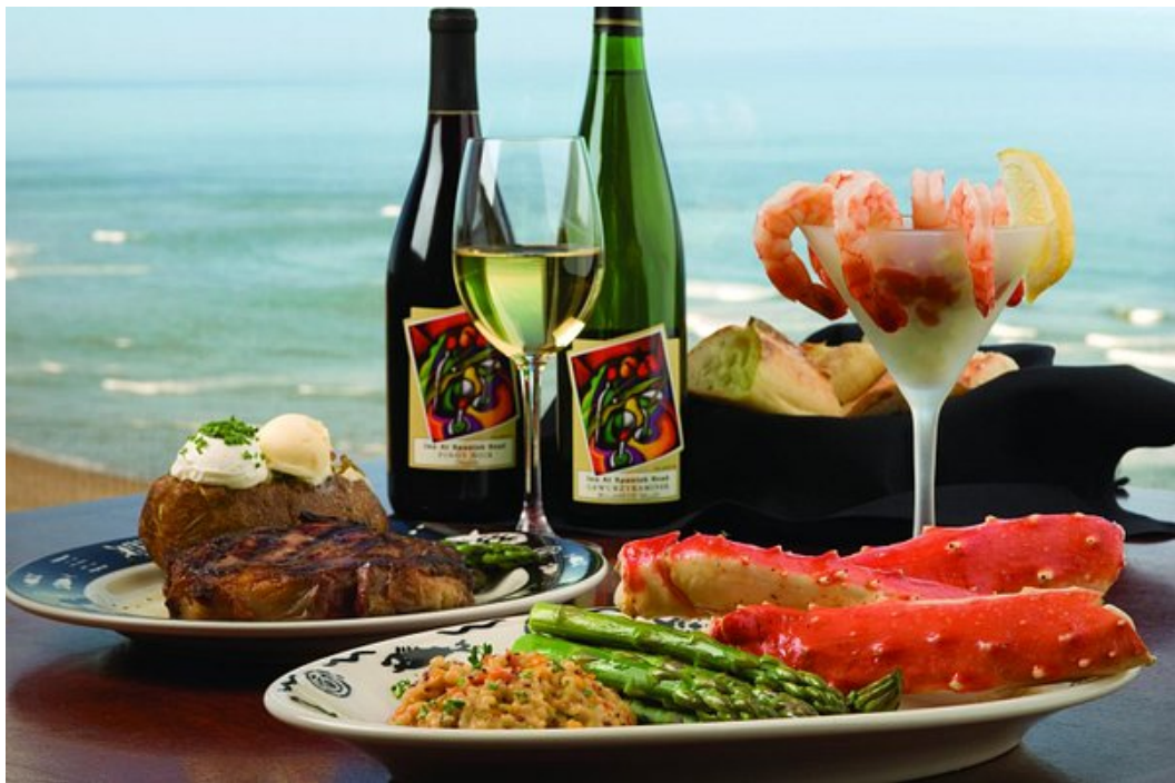
A delicious meal from Lincoln City, Oregon.