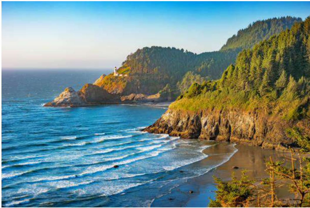
A lovely beach with a lighthouse far away on the Oregon Coast.