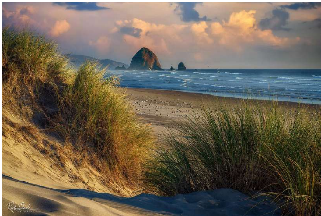
Huge sand hills along the Oregon Coast.