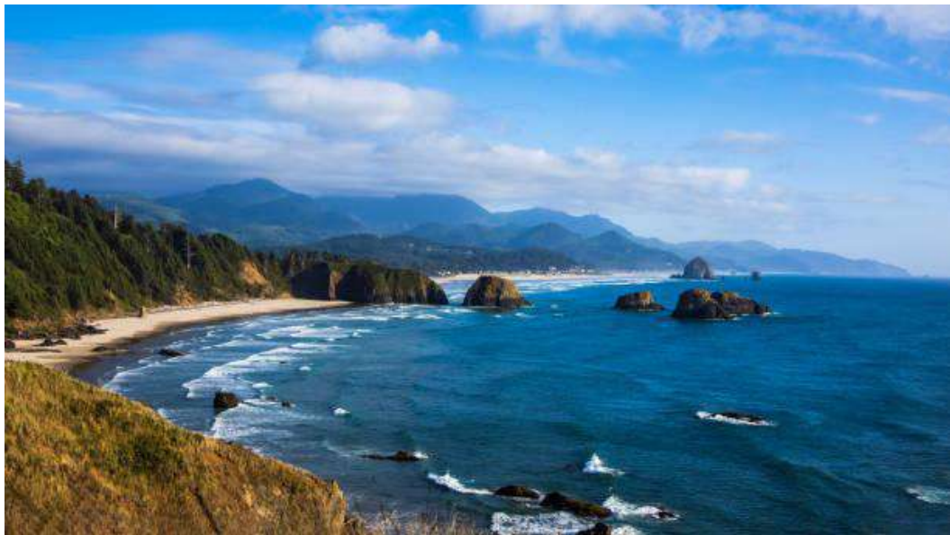
Big cliffs and waves crashing on the shore.

To get you excited for your trip, here are some great pictures of the Oregon Coast. They show you how beautiful and different this place is. They give you a taste of the amazing sights you will see.