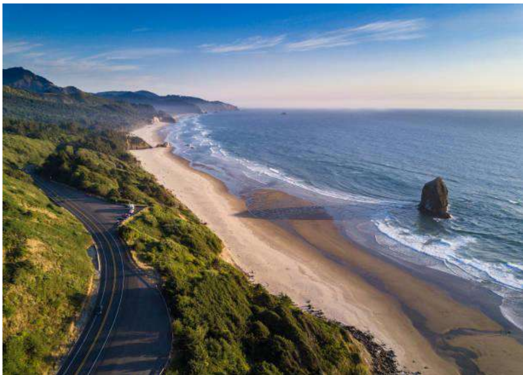
A pretty road winding along the Oregon Coast.