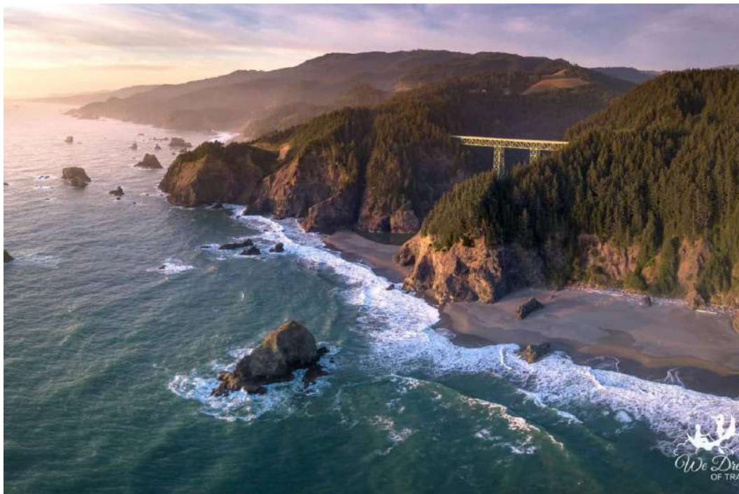
A view from above of the rough Oregon Coast.