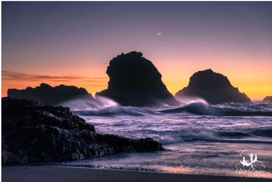
A bright sunset over the Oregon Coast with big rocks in the sea.