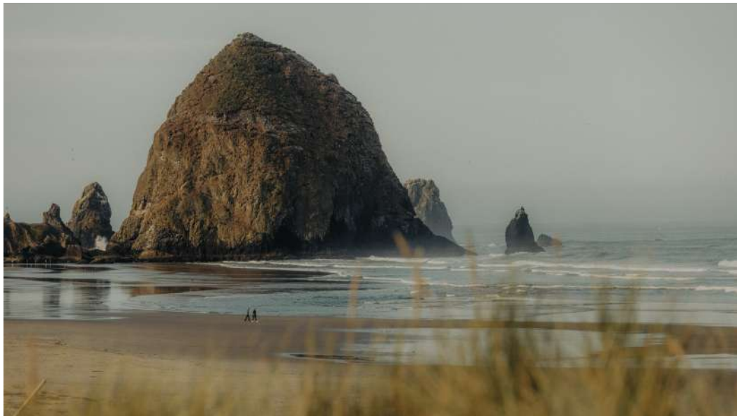
The famous Haystack Rock at Cannon Beach.